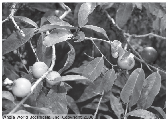
Whole World Botanicals, Inc. Copyright 2006